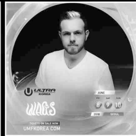
Ultra Music Festival Korea 2018 Seoul, South Korea