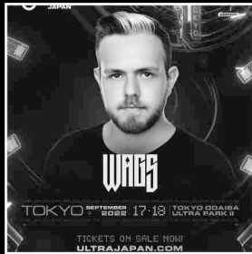
Ultra Music Festival Japan 2022 Tokyo, Japan