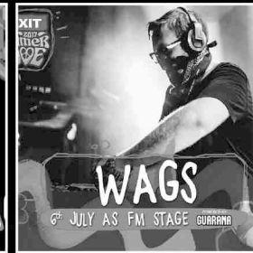
Exit Festival 2017 Novi Sad, Serbia