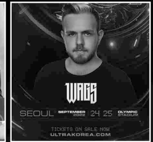
Ultra Music Festival Korea 2022 Seoul, South Korea

Wavefront Music Festival • 2012 • Chicago, IL, USA