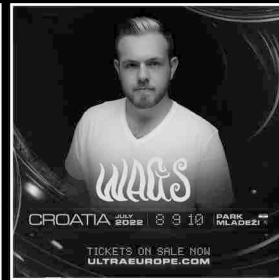
Ultra Music Festival Europe 2022 Split, Croatia