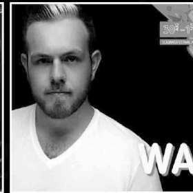
SeaDance Festival 2019 MAIN STAGE Budva, Montenegro