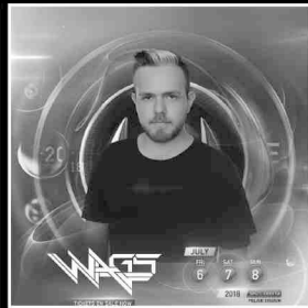
Ultra Music Festival Europe 2018 Split, Croatia